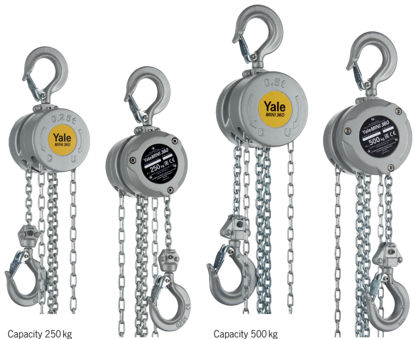
Capacity 250 kg