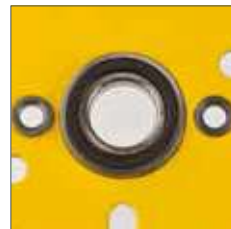
Side plate with ball bearing