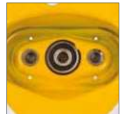
Housing cover with ball bearing