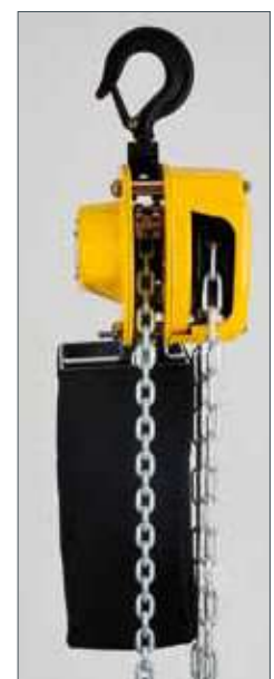
Option: Chain container