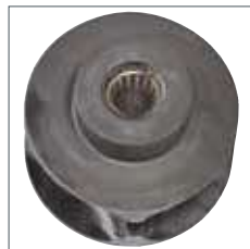
Load chain sheave with needle bearing