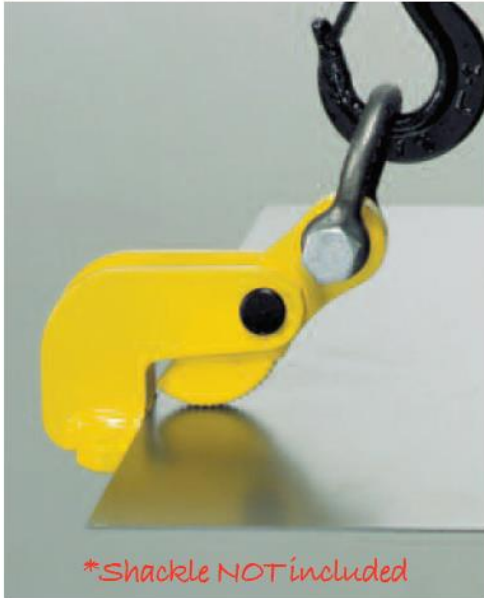
*Shackle NOT included

The THK horizontal plate clamps share the same basic design features as the CH range of clamps but have a reversed tooth jaw design. This safety feature is designed for use with thin sheets which may have a tendency to deflect or sag or flex.