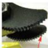
CH with serrated jaw which can only be used for single plates, NOT bundles