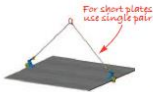
For short plates use single pair