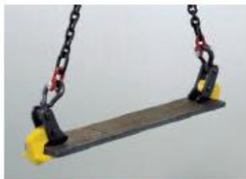
*Chain slings NOT included